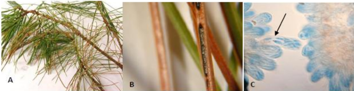
Figure 3.2: Needles (A) with chlorosis and necrosis from Sangerville, Maine, infected with Canavirgella banfieldii , fruiting body (B) is embedded in the needle (x20) and ascospores (C) are not constricted in the middle (x200). Spores are stained with methyl blue.